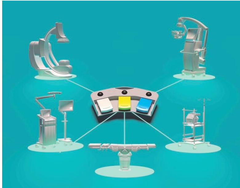
A state-of-the-art OR.NET demonstrator for the interoperable OR.

At the hardware level, the SDC concept in the OR is realised in a first step by connecting all medical devices via integrated SDC connectors. The development and implementation effort required is smaller due to the incorporation of standards within these connectors, meaning that devices can be linked more easily to other devices, e.g. of larger manufacturers. In particular for small and medium-sized enterprises (SME), market entry will then be more viable.